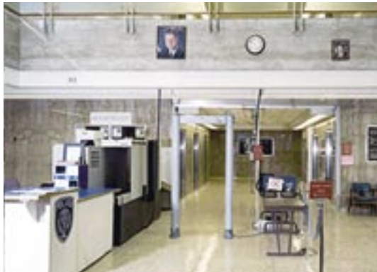
Wallace F. Bennett Federal Building, Salt Lake City, UT, before (top) and after.

Public spaces such as parks and squares play a huge role in shaping the identity of the communities where they are located: Think of the majestic Trevi Fountain in Rome or Philadelphia's famed Rittenhouse Square. Likewise, federal buildings project a strong message to the public about both the surrounding area and the agencies they represent. Every GSA facility constantly shapes people's perceptions of the federal government, from the sidewalk—where the edges of the property send the first signal to the public—to the interior—where visitors interact with tenant agencies. At each step in the sequence, GSA staff should ensure that the purpose of the building is clear; the quality of materials is excellent; and the spaces are free of clutter. Improving the image and aesthetic character of GSA properties is crucial both for facilities to function as community assets and for tenant agencies to fully express their missions.