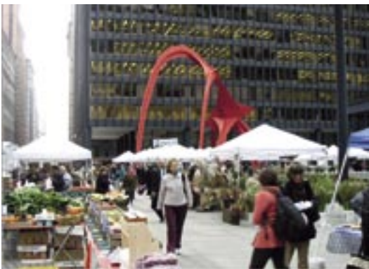
John C. Kluczynski Federal Building, Chicago, IL, before the weekly farmers market (top) and during.