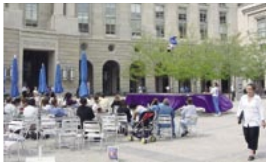
Flexible security arrangements enable Washington DC's Reagan Building to hold hundreds of public events annually.