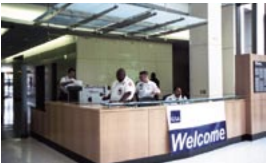
A better solution is to provide a welcoming presence through well-integrated security measures, such as the security desk at the Byron Rogers Federal Building in Denver, CO.