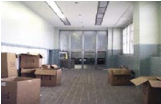
Federal Building and U.S. Courthouse, Martinsburg, WV, before (above) and after (right).

The best civic places are the ones that people return to time and time again. The only way to achieve this is through management that adapts to the pulse of the place in question. For example, a good manager understands who constitutes the existing and potential users of a particular facility. In terms of maintenance, public space management means becoming so familiar with the patterns of how people use the facility that waste receptacles get emptied at just the right time, horticultural displays change with the seasons, and refreshment kiosks are open when people most want them. By programming and maintaining their facilities' public spaces, good managers create a feeling of comfort and safety—giving people a sense of assurance that someone is in charge. Continual evaluation of how well a building plaza or lobby is serving these users makes it all possible, enabling GSA staff to successfully tailor amenities to meet users' needs and gear events, exhibits, or other programs to the right audience.