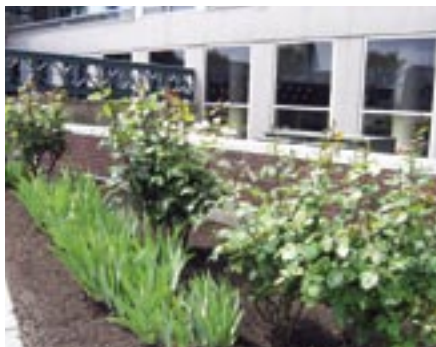
Planting bed, U.S. Courthouse, Tacoma, WA.