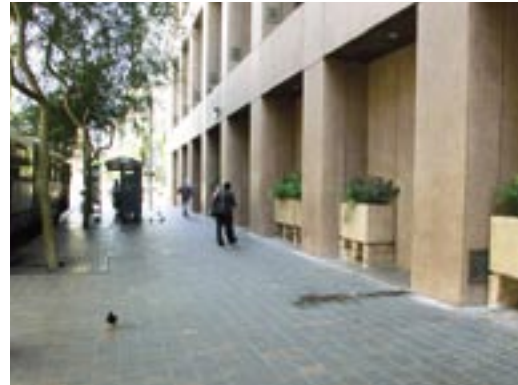
Edward J. Schwartz Federal Building, San Diego, CA, before (top) and after.

It's difficult to project a positive image of the federal government when a property's physical appearance is lacking. Outside, the challenge may take the form of blank walls that repel people and discourage pedestrian activity. Inside, it may be a cluttered lobby, poor lighting, or unattractive materials and finishes. Throughout, the mission of tenant agencies may not come across clearly to visitors, because there is no comprehensive signage or information program in place. The good news is that poor appearance is not a permanent affliction. Many GSA properties have overcome aesthetic deficiencies to win design awards and achieve recognition for their improved image.