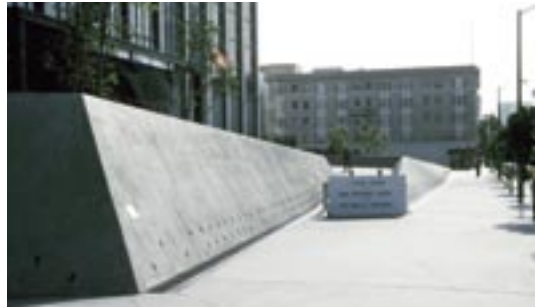
Phillip Burton Federal Building and U.S. Courthouse, San Francisco, CA.