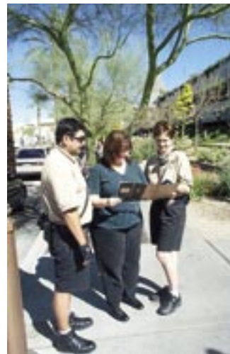
Employees of the Business Improvement District in Phoenix, AZ, review a map of downtown with GSA's building manager.

Engaging partners outside the federal government can be intimidating. GSA staff may be reluctant to reach out to local governments or other agencies because past projects have strained relationships. The desire to go it alone, however, bears very negative consequences for GSA properties. By not collaborating with local authorities on infrastructure improvements or working with neighborhood groups to host programs and events, property managers risk turning federal buildings into islands without connection to surrounding communities. Relationships with local agencies will only deteriorate in this scenario. In fact, communicating with local agencies as early and often as possible on issues of mutual interest is the best way to build healthy partnerships and maximize GSA's positive impact in the communities where we operate.