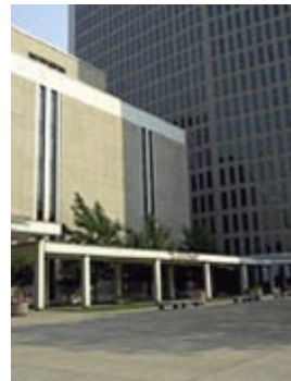
Byron Rogers Federal Building Plaza, Denver, CO, before (left) and after (below).

When not well-designed, architectural features may simply punctuate a space or make a “design statement” without actually serving the user. The result is dysfunctional space that actively discourages human activity. The hallmarks of dysfunctional space include: permanent, immovable elements; a space that can only function for one purpose; the lack of any place to sit or congregate; and empty spaces with no focal point. The basic rule of thumb is that people will not use a space that does not offer a good reason to be there. Adding some benches, lawns, or art—however well-intentioned—is not enough if done without thought as to how people will use those elements. By introducing flexible amenities and arranging them to support the desired activity of building tenants and visitors, a dysfunctional space can become a user-friendly place.