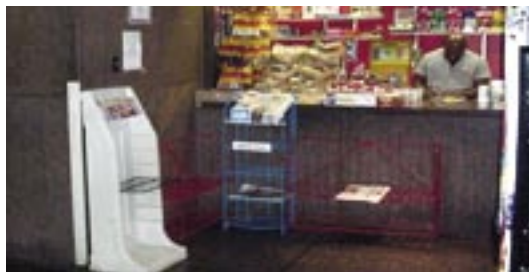
Snack bar, William J. Green Federal Building, Philadelphia, PA, before (above) and after (right).

Seating is not the only important element in designing for use. Infrastructure for games or performances can also create a great magnet for children or a forum for adults to come together. Lighting can highlight these activities, as well as entrances and pathways. Indoor or outdoor retail kiosks introduce a human touch and draw people throughout the day. Whether temporary or permanent, good amenities arranged the right way will establish a convivial setting for social interaction.