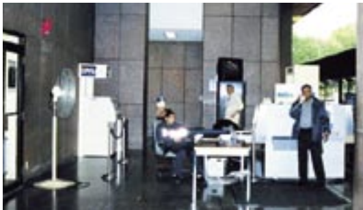
Disorganized interior security not only is inefficient, but can intimidate first-time visitors with its bulk and lack of logical flow.

It's unavoidable: safety and security are of paramount concern in these times. But all too often security "solutions" transform a public building into a cold, forbidding place—a veritable fortress. The barriers can be physical, such as ubiquitous concrete Jersey barriers and unrelenting rows of bollards around the property's perimeter, or a matter of logistics, such as a lengthy, intimidating screening process inside the building. Perhaps even more pervasive are the psychological barriers that arise when a building is secured according to the misguided notion that "no people" equals "no problem." The challenge for building managers is to maintain active and open facilities in a time of enhanced vigilance and heightened fear. Washington, D.C.'s Reagan Building (below, bottom right) is a testament to GSA's ability to overcome the fortress mentality: Not only is it one of the country's highest-profile and highest-security federal buildings, but it is also one of the most active, with hundreds of public events held annually.