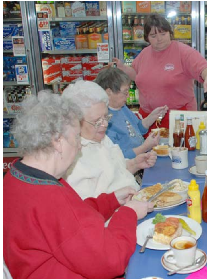
Washington County seniors have many area restaurants to choose from. Above, a group of seniors enjoys lunch at Scottie's Coffee Shop in Granville. Hundreds of seniors in the county participate in this innovative program.

Consumers can request tickets good for 3 month periods by mail or in person. Customers are provided with an opportunity to make a voluntary donation for the tickets they request and are asked to register for the congregate