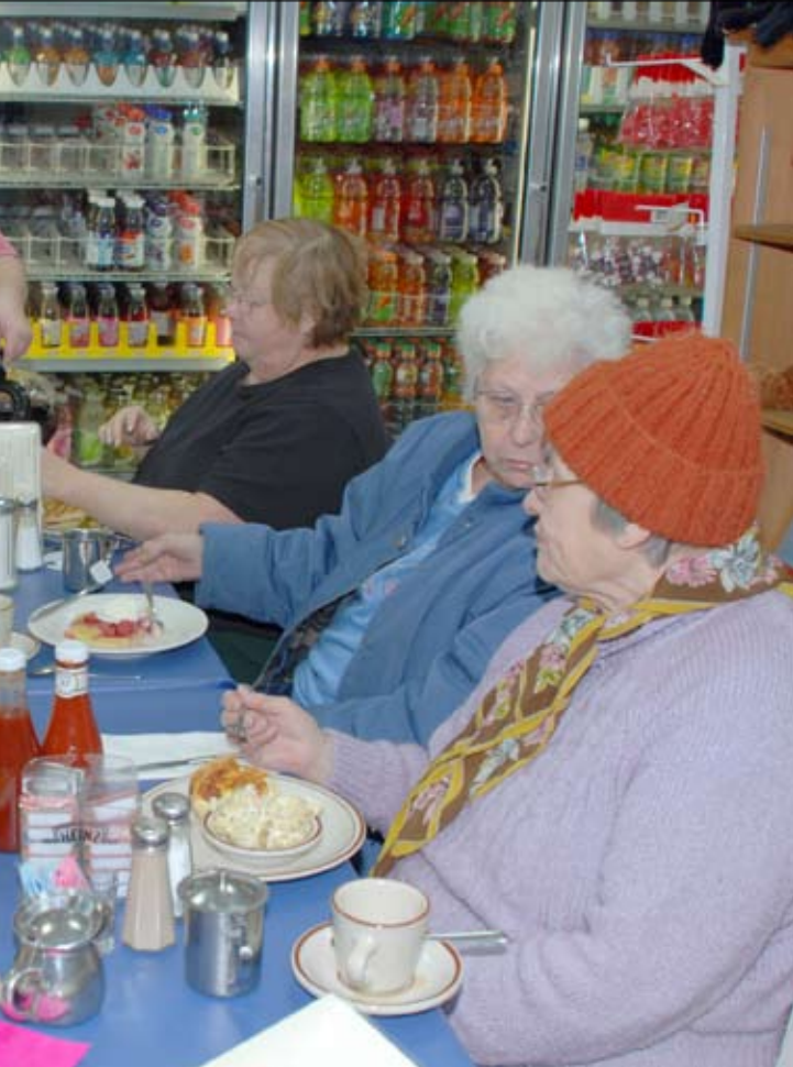
Washington County seniors have many area restaurants to choose from. Above, a group of seniors enjoys lunch at Scottie's Coffee Shop in Granville. Hundreds of seniors in the county participate in this innovative program.